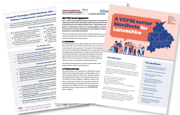
(Images: LCR VCSE Manifesto, GM VCSE Accord, LOCAL Lancashire VSF Manifesto)